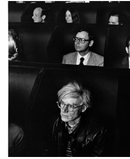
Andy Warhol at Anthology's Invisible Cinema at the Public Theater

Individual, Student, Senior or Dual memberships include: