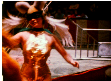
Film still from Jonas Mekas' NOTES ON THE CIRCUS.

Anthology's preservation projects include works by artists, auteurs, and amateurs alike. It is only by restoring the films in our collection that we can share them with the world, through screenings at our theater and through loans to other museums, cinematheques, film festivals and universities. As of 2009, nearly 800 films have been restored and preserved by Anthology, with generous funding and support from individuals and institutions.