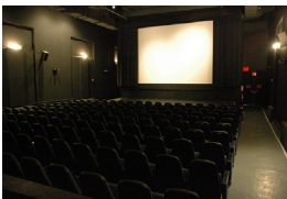
The Courthouse Theater

In addition to our signature Essential Cinema series and other ongoing programs, Anthology continually presents premieres, revivals, retrospective and survey screenings of contemporary and classic works of cinema. Anthology features important and often under-recognized filmmakers and artists working in a wide range of styles and genres. Anthology screens more than 900 programs per year and features appearances by artists with their work.